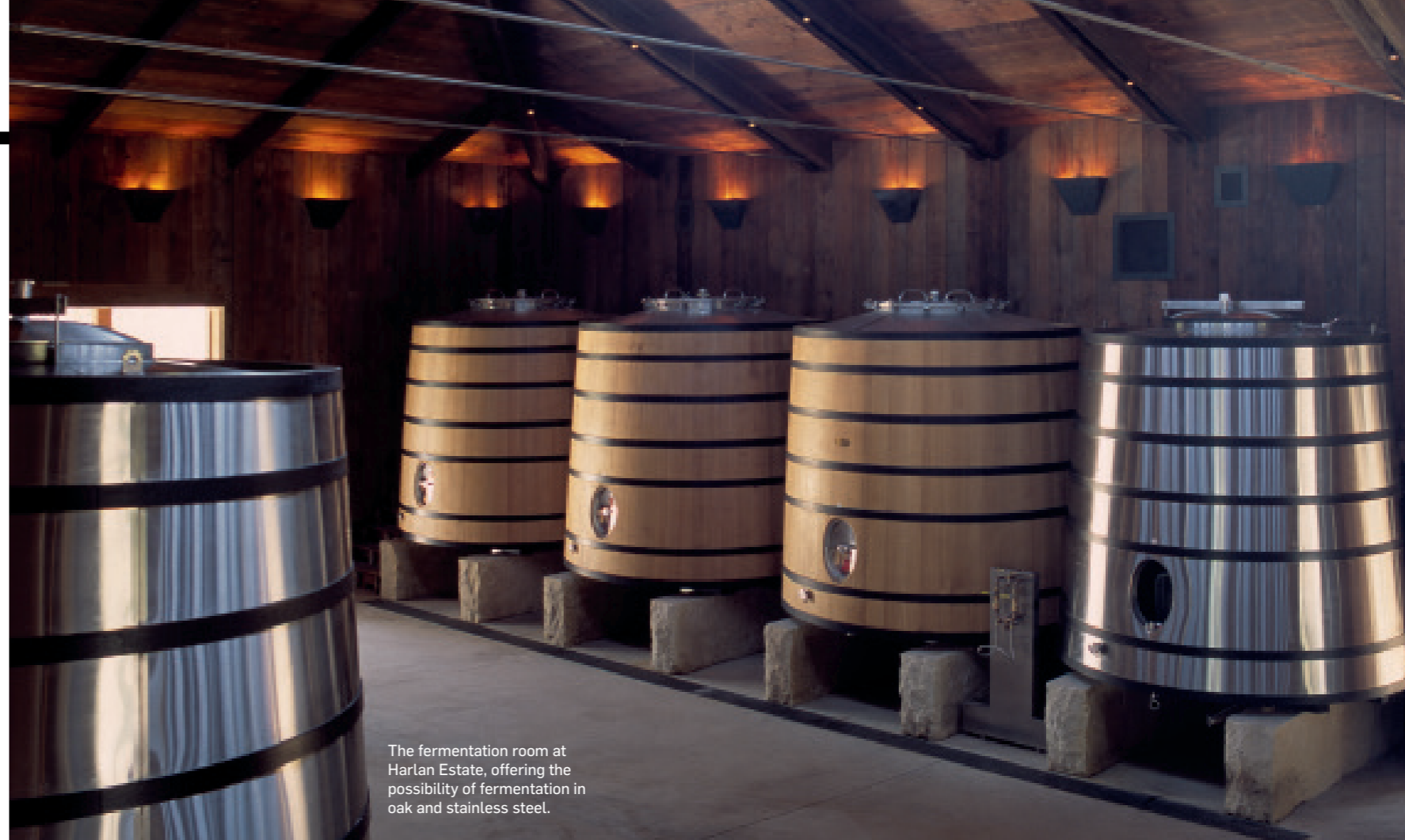
The fermentation room at Harlan Estate, offering the possibility of fermentation in oak and stainless steel.