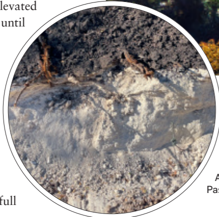
Above: Inland heat draws cold air and fog from the ocean into the valleys. Inset left: A limestone seam in the soils of the Adelaida District in Paso Robles.

With its high proportion of American oak in winemaking, expressed in rich tones of coconut and vanilla which suits the ripe but defined fruit, Monte Bello is unmistakably and unapologetically Californian.