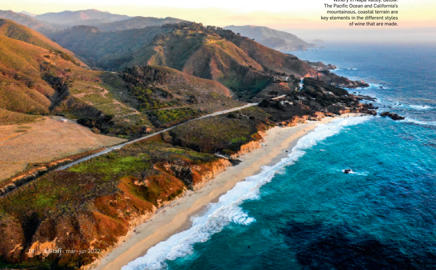
Photos: To Kalon, Ridge Vineyards, Napa Vintners/Bella Spurrier Getty Images/Adam Kaz

Today, the long shadow cast by the 1980s, 90s and 2000s is waning and California, >