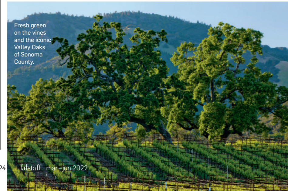
Fresh green on the vines and the iconic Valley Oaks of Sonoma County.