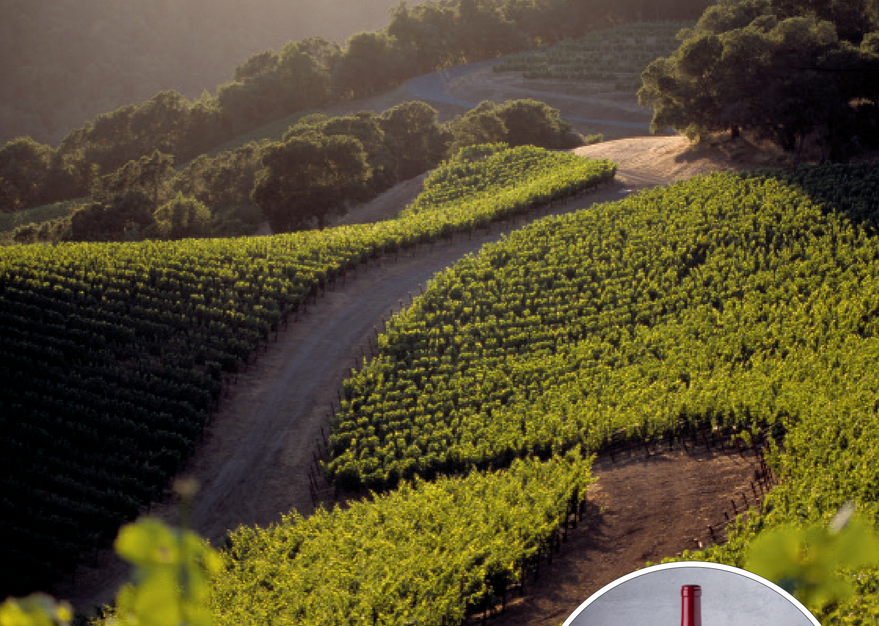
Above: The mountainous terrain of the vineyards at Harlan Estate. Inset: The trio of Verité wines from Sonoma.