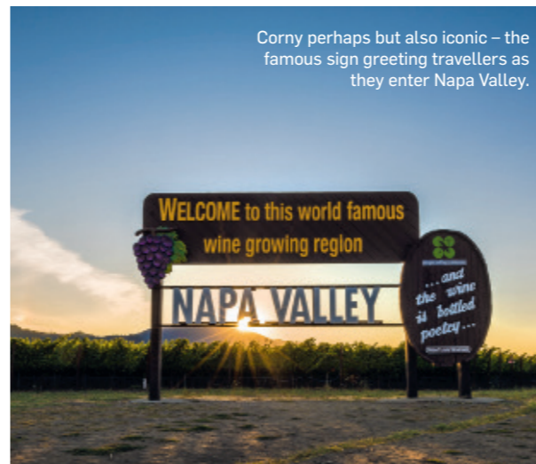
Corny perhaps but also iconic – the famous sign greeting travellers as they enter Napa Valley.