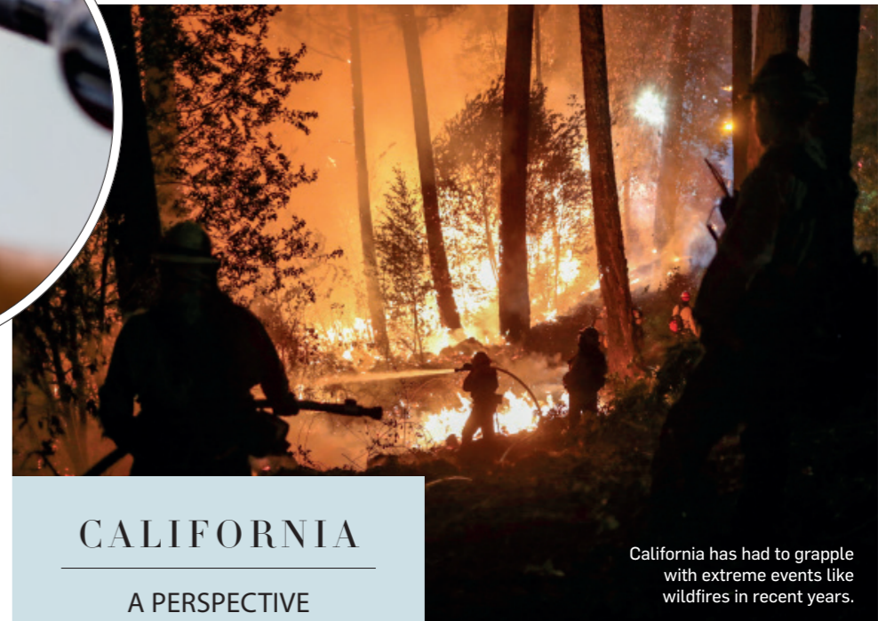
California has had to grapple with extreme events like wildfires in recent years.