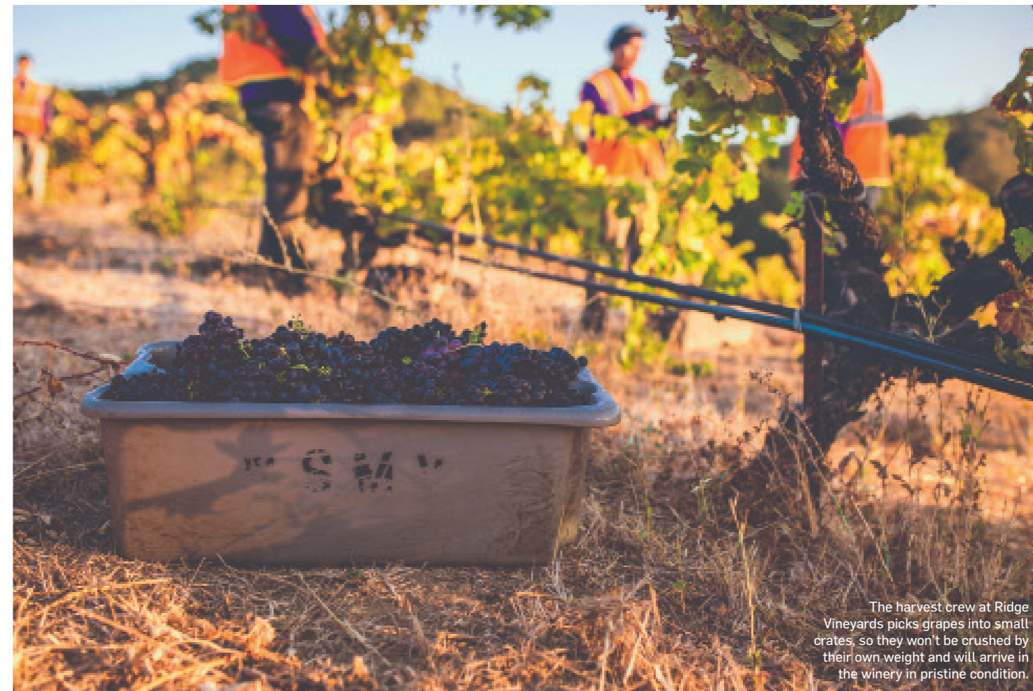
The harvest crew at Ridge Vineyards picks grapes into small crates, so they won't be crushed by their own weight and will arrive in the winery in pristine condition.

Inset above: The Robert Mondavi Winery in Napa Valley. Below: The Pacific Ocean and California's mountainous, coastal terrain are key elements in the different styles of wine that are made.