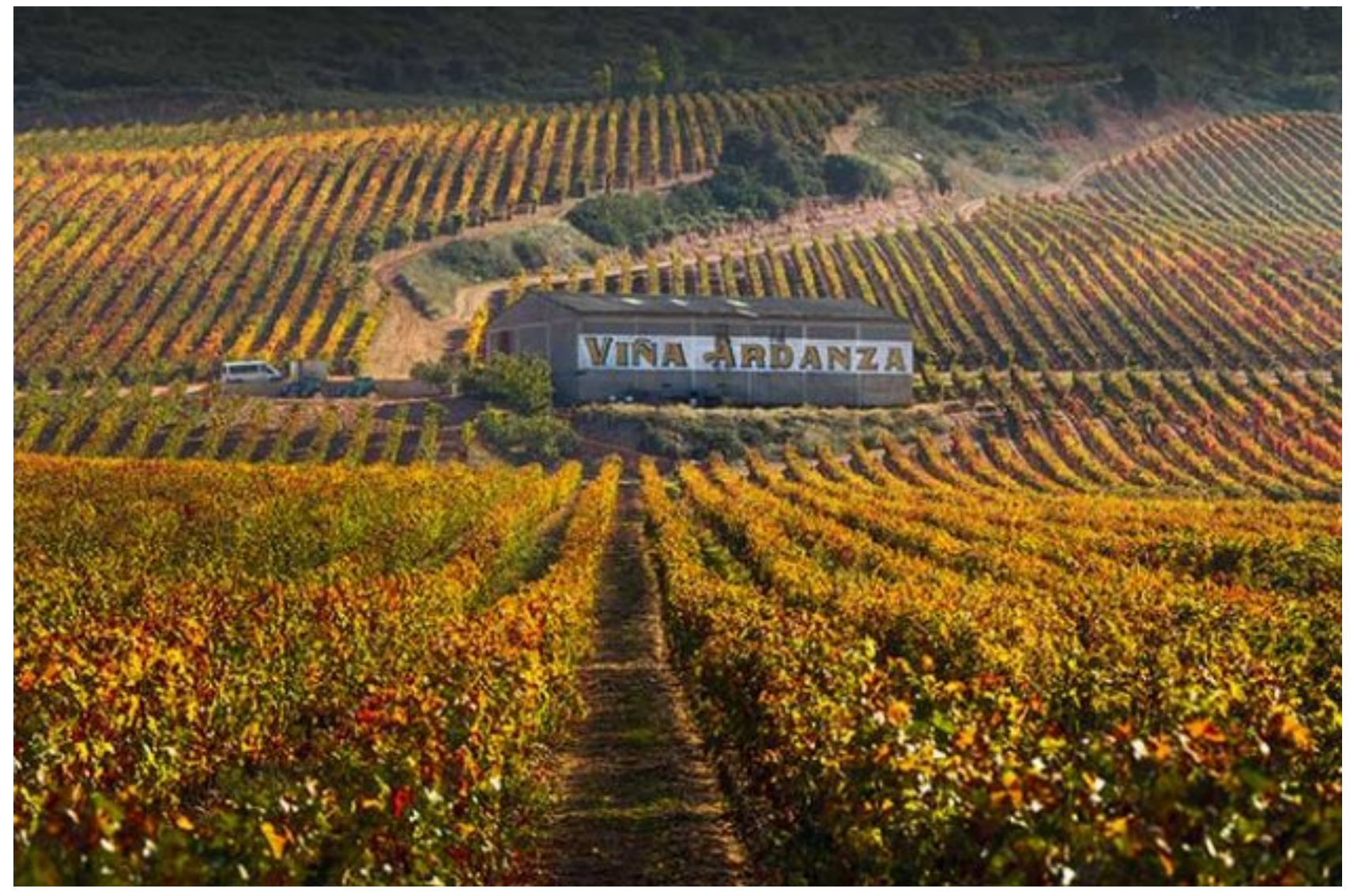
(http://www.decanter.com/sponsored/vina-ardanza-la-rioja-alta-s-a-353710/) The 75th anniversary of the iconic wine... (http://www.decanter.com/sponsored/vina-ardanza-la-rioja-alta-s-a-353710/)